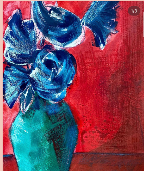
"Harmony in Red"