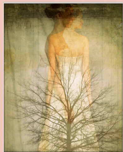
Cambric and Cotton