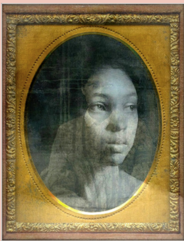
Lift Every Voice

I have spent the past several years trying to come to terms with this unholy legacy; using my art practice to work through this emotional debt. I searched through generations of family documents and slave schedules to discover where my ancestors had lived and the numbers, though rarely the names, of the people who worked the land against their will. I used these found photographs, maps and documents to remember and bring dignity to people robbed of their rightful stories. The titles are taken from the words of the "Black National Anthem," "Lift Every Voice" written by James Weldon Johnson. In this series of images I hope to bring to light these untold stories and pay my own form of soul reparations, however inadequate.