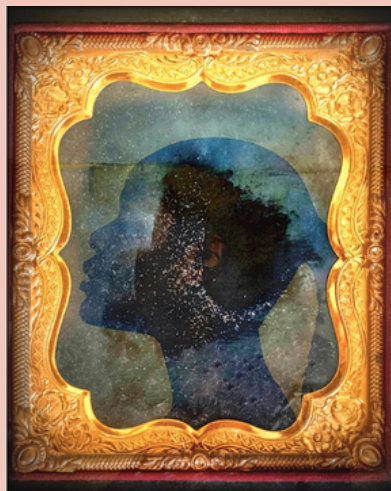
Dark Past Has Taught Us